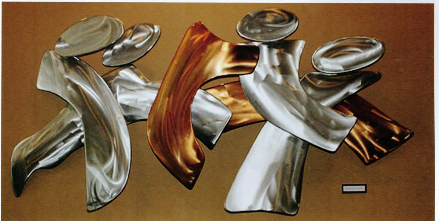
The Gathering , 40"W X 34"H X 5"D, Aluminum