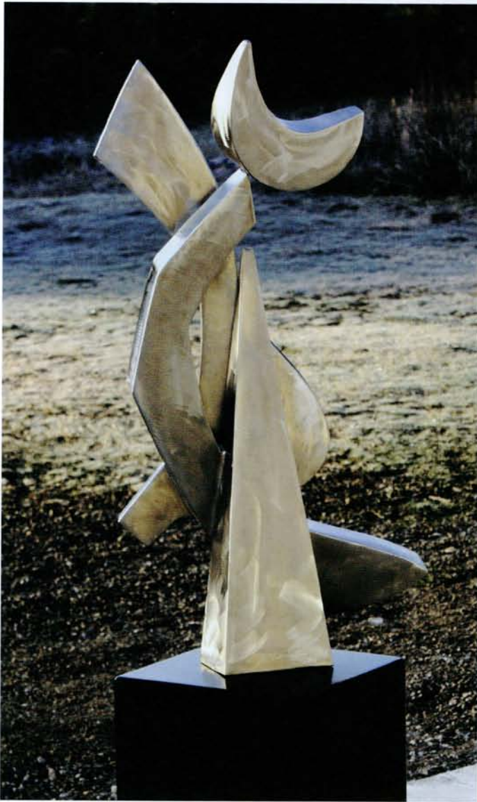
Silver Moon , 61"H X 18"W X 16"D, Stainless And Steel Base