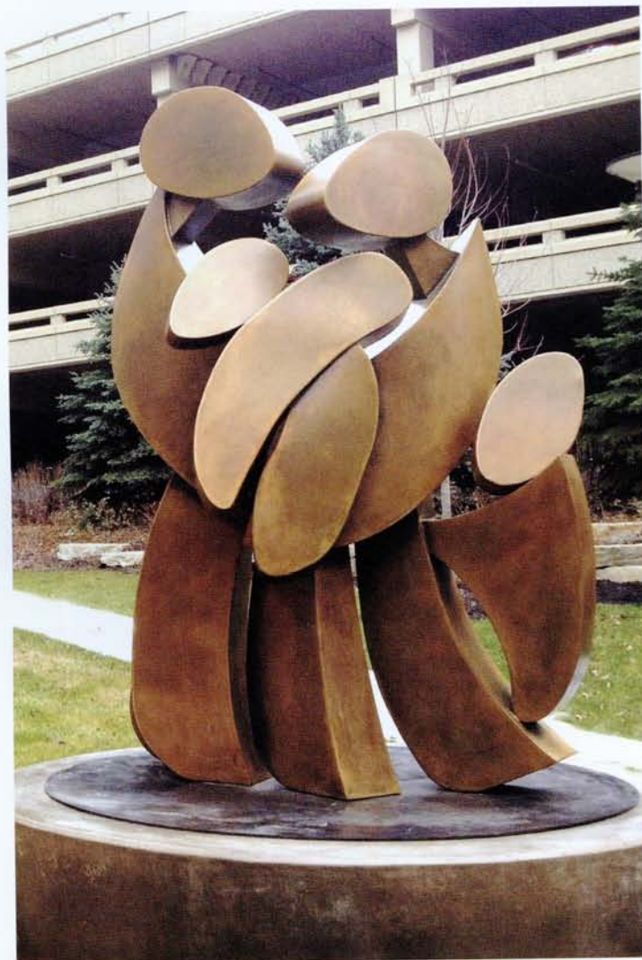
Protector of the Family , 10'h x 6'w, Bronze, Central DuPage Hospital, Winfield, IL. 2011