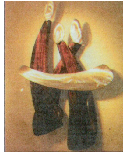
Sculptor's Metal Wall Pieces On Display

Call the gallery at (813), 258-2244 for information.